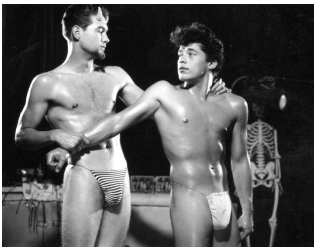
Figure 2: Still from Scientist and the Demon , Courtesy Bob Mizer Foundation.

Given this efficient production system, Mizer also needed a distribution arrangement that emphasized his product variety. He accomplished this by interspersing the release dates of films across thematic product lines (such as the Frankenstein shorts) so that similar films were not released simultaneously. The Frankenstein-line averaged a new film in release every year or two. To make customers aware of the films, Mizer