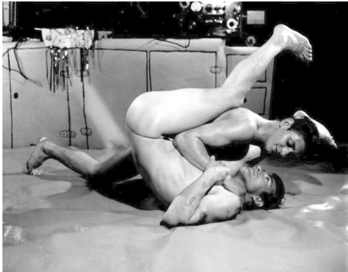
Figure 1: Still from Making of a Monster .

Mizer's series of Frankenstein films were shot on markedly similar sets, sometimes identical. Most of the films contained at least some form of electrical machine (often with a climbing high voltage arc), a gurney or laboratory table, makeshift cabinets that on close inspection had drawn-on hinges and doors, and a mat on the floor for wrestling.