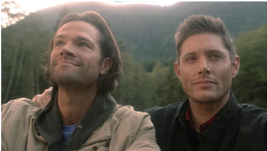
Figures 10 and 11: The clothes Sam and Dean wear in the pilot episode (1.1 top) are reproduced in the final scene of the series finale episode “Carry On” (15.20 bottom).