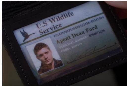
Figures 3 and 4: The U.S. Wildlife Service IDs used by Sam and Dean in the Season 15 episode "Proverbs 17:3" (15.5)