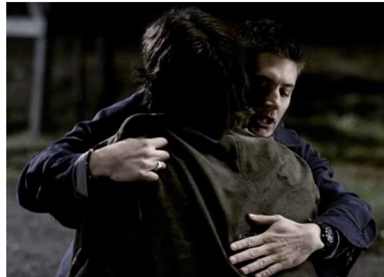
Figures 6 and 7: Sam dying in Dean's arms in "All Hell Breaks Loose (Part 1)" (2.21)