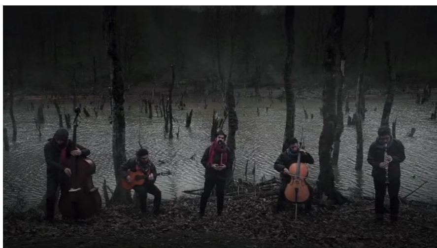
Figure 2: A performance by Pallett.

Mina and Kambiz. Mina informs him that Maral has gone to a restaurant for lunch and not returned. Mina jokes, “About Maral,” a reference to the film About Elly (Asghar Farhadi, 2009), in which the titular character also goes missing. Mokri finally shows Maral when Hamid approaches her reading under a tree. She gives him one of her earphones to listen, at which point a voiceover from Maral begins, in which she narrates her murder at Hamid’s hands. As she explains, the song heard in the earphones is “Fish and Cat” by the band Pallett, and it begins to play as Hamid pulls a knife from his sleeve, presumably to carry out the killing. The camera then pans 180° to show Pallett in long shot playing the song, followed by a crane out showing kites flying over their heads (Figure 2).